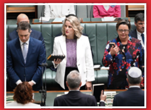
It was a proud moment to take the oath at the opening of the 47th Parliament.