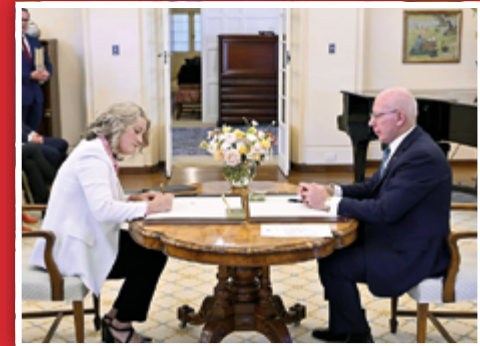
I was so honoured to be sworn in as the Minister for Home Affairs and Minister for Cyber Security in the 47th Parliament.