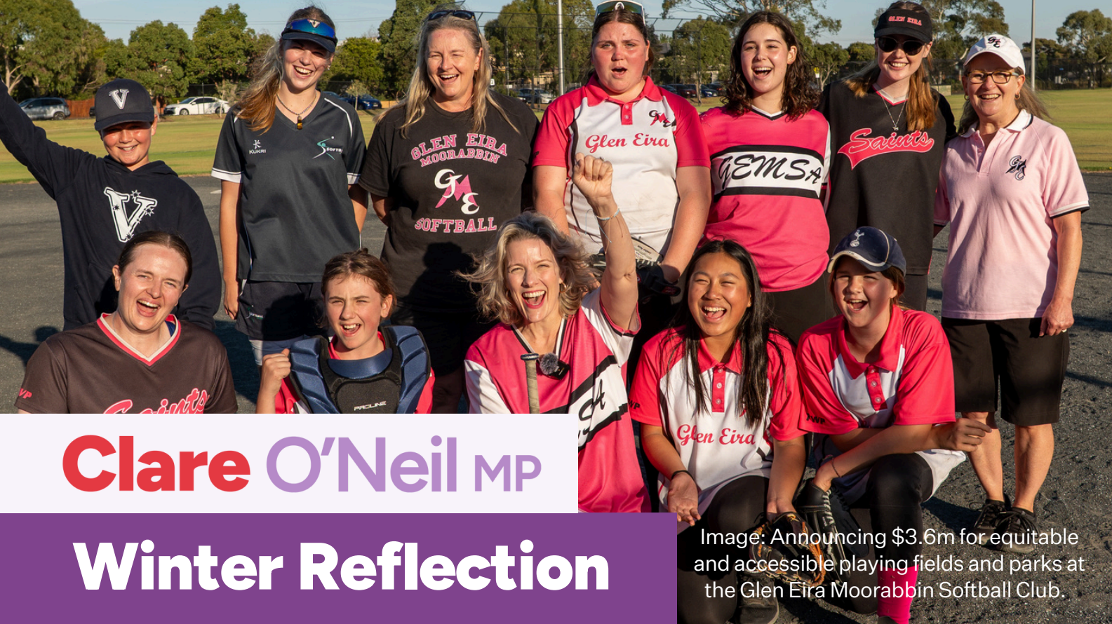
Image: Announcing $3.6m for equitable and accessible playing fields and parks at the Glen Eira Moorabbin Softball Club.