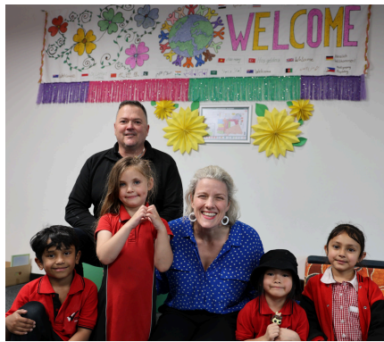
ANNOUNCING $572,113 FOR A NEW PLAYGROUND AT WESTALL PRIMARY SCHOOL