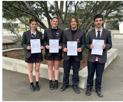
BENTLEIGH SECONDARY COLLEGE

Wishing Hotham students all the best with their assessments and a special mention to those about to graduate. Here are some snaps of local Year 12 students with 'Stuff You Should Know' - a resource I sent them for navigating their next stages and accessing government services.