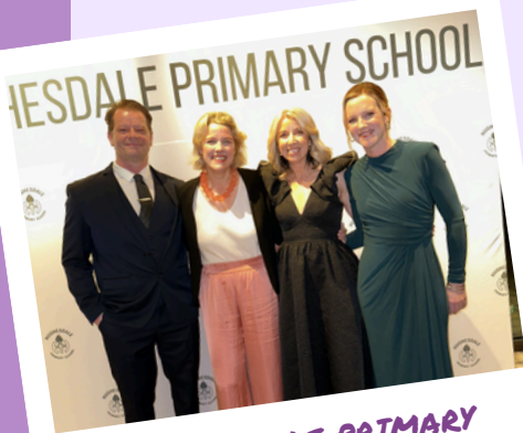
HUGHESDALE PRIMARY SCHOOL TURNS 100!

Wishing Hotham students all the best with their assessments and a special mention to those about to graduate. Here are some snaps of local Year 12 students with 'Stuff You Should Know' - a resource I sent them for navigating their next stages and accessing government services.