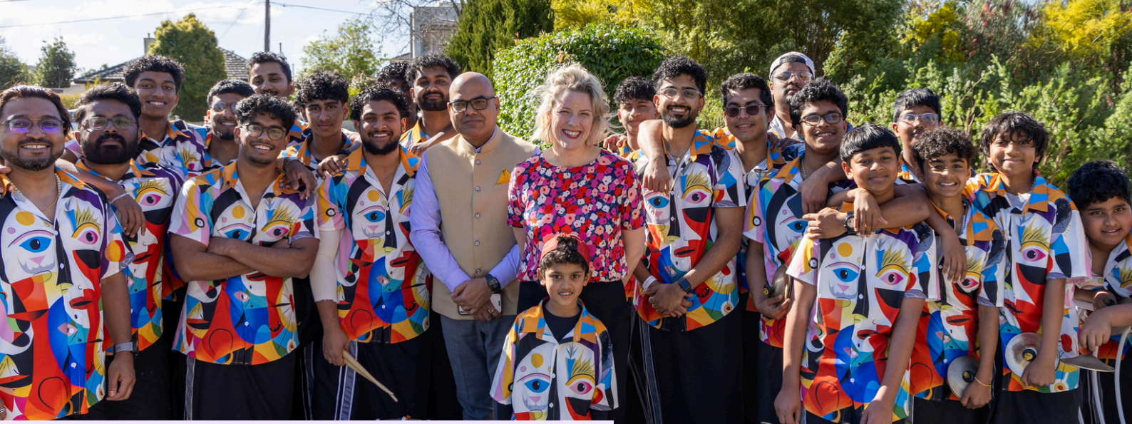
Image: Celebrating Onam in Springvale.