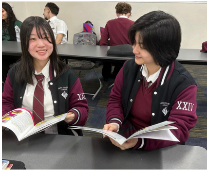
SOUTH OAKLEIGH COLLEGE